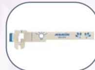
8001JFW Neonate FlexiWrap®