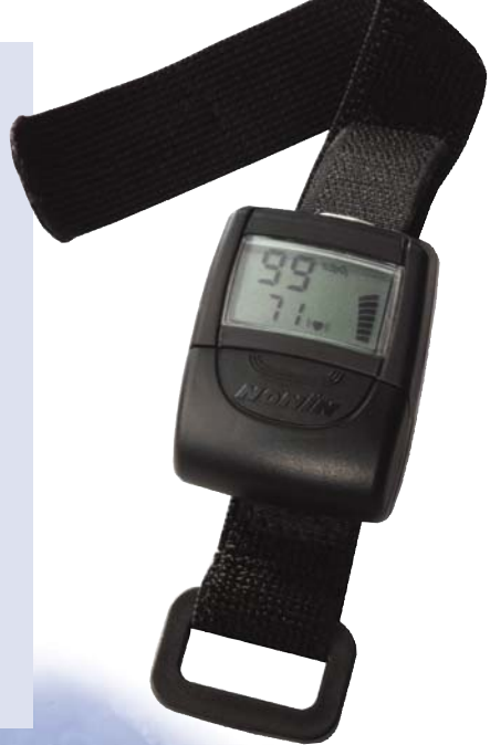
3100 WristOx ® Wearable Digital Pulse Oximeter