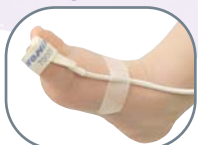
7000I Infant Flexi-Form® II (2 - 20 kg / 4 - 44 lbs)