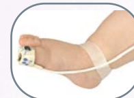
Infant Flex System (2 - 20 kg / 4 - 44 lbs)