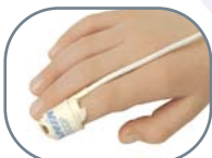
7000P Pediatric Flexi-Form® II (10 - 40 kg / 22 - 88 lbs)