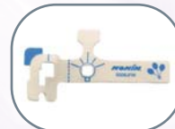
8008JFW Infant FlexiWrap®