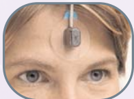
8000R Reflectance (> 30 kg / > 66 lbs)