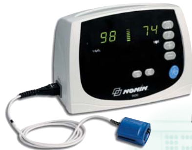
Avant® 9600 Digital Pulse Oximeter