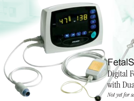
FetalSAT™ Digital Fetal Pulse Oximeter with DualSens® Sensor Not yet for sale in the US.

Additional products available for use in MRI and veterinary environments. Compatible with nVISION® Data Management Software.