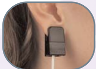
8000Q Ear Clip (> 40 kg / > 88 lbs)