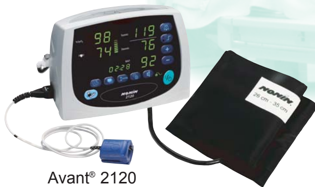
Avant® 2120 Digital Pulse Oximeter with Noninvasive Blood Pressure