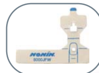
8000JFW Adult FlexiWrap®