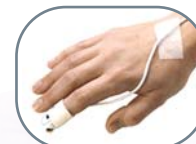
Adult Flex System (> 20 kg / > 44 lbs)