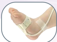
7000N Neonatal Flexi-Form® II (< 2 kg / < 4 lbs)