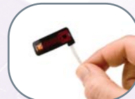
8008J Infant Flex Sensor