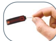
8000J Adult Flex Sensor