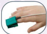
8000AP Pediatric Finger Clip (10 - 40 kg / 22 - 88 lbs)