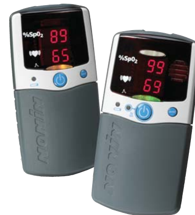
2500A PalmSAT ® Digital Pulse Oximeter with Alarms Product not yet for sale.