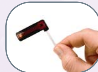
8001J Neonate Flex Sensor