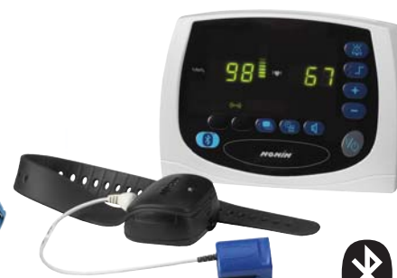
Avant® 4000 Wearable Digital Pulse Oximeter with Bluetooth® Wireless Technology