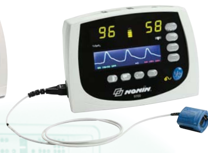
Avant® 9700 Digital Pulse Oximeter with Waveform