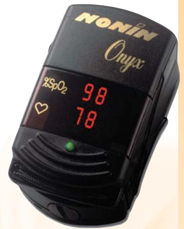
9500 Onyx® The Original All-In-One Digital Fingertip Pulse Oximeter™

Make the Onyx a vital part of taking vital signs.