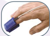
8000AA Adult Finger Clip (> 30 kg / > 66 lbs)