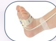
Neonate Flex System (< 2 kg / < 4 lbs)