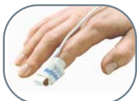
7000A Adult Flexi-Form® II (> 30 kg / > 66 lb)